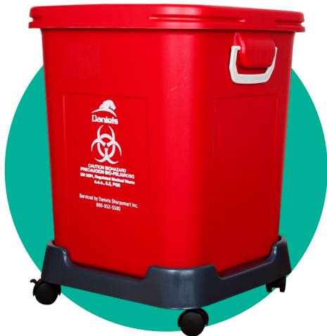
28 GALLON RMW REUSABLE TUB