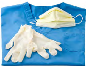
Masks and gowns