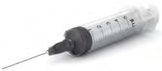
Needles / Syringes

All used sharps capable of cutting or piercing the skin (except those contaminated with chemo).