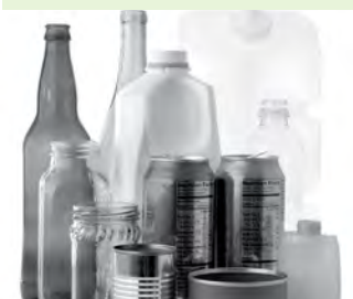
Plastic bottles and drink cans