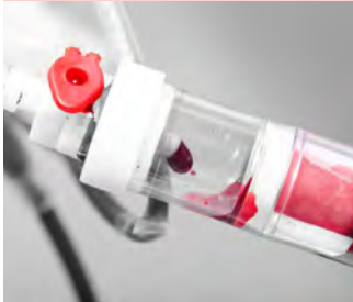
Suction canisters or liners with bloody fluid or OPIM