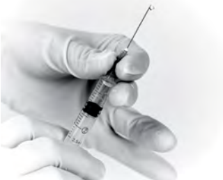
Syringes with residual meds