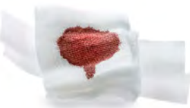
All disposable items soaked or dripping with blood or other body fluids