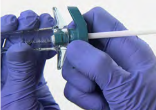
Carpuest with residual meds

Includes all pharmaceuticals that are not a listed or characteristic RCRA waste, not a NIOSH hazardous drug, and not an investigative chemotherapy agent. Labeled as "Incineration Only".