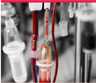
Blood tubing/bags/ hemovacs/pleuravacs

Contained separately in a biohazard bag labeled with the words "Biohazardous Waste" or with the international biohazard symbol.