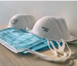
Masks and Aprons