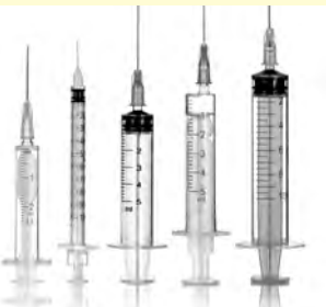
Needles / Syringes