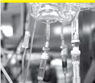
Tubing and empty bags

Waste that is contaminated through contact with chemotherapeutic agents. Labeled as "Incineration Only".