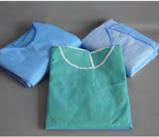
Chux/underpads and disposable patient items