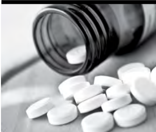
Hazardous R.C.R.A Pharmaceuticals